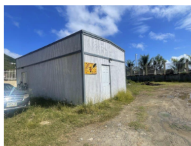
Subject property -Building 3