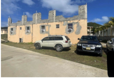
Subject property Building 1 (rear)