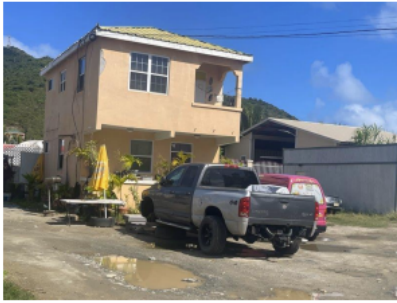
Subject Property -Building 2