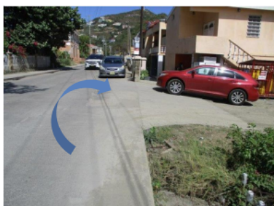
General access -off the Blackburn Highway